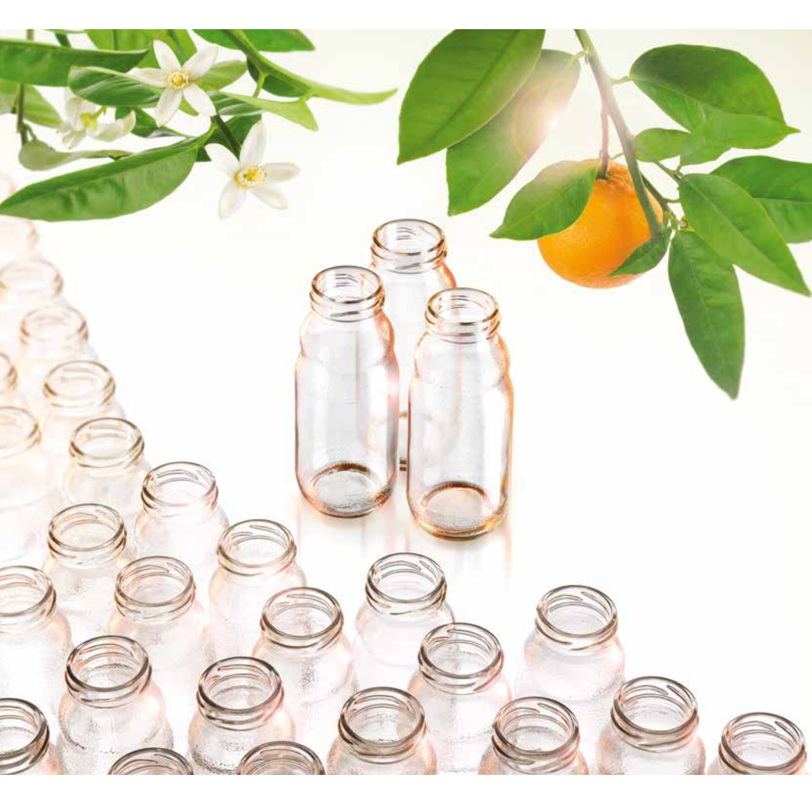
2014 | Semi-Annual Report Vetropack Group