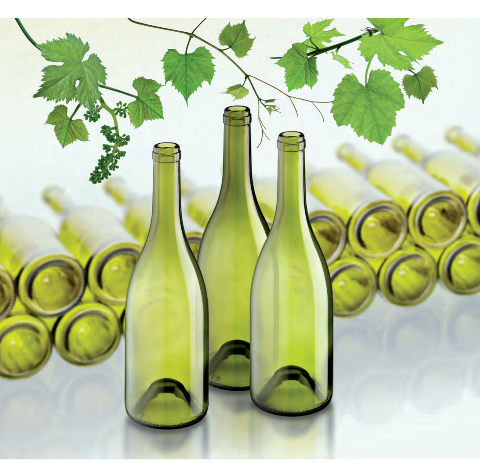
2013 | Semi-Annual Report Vetropack Group