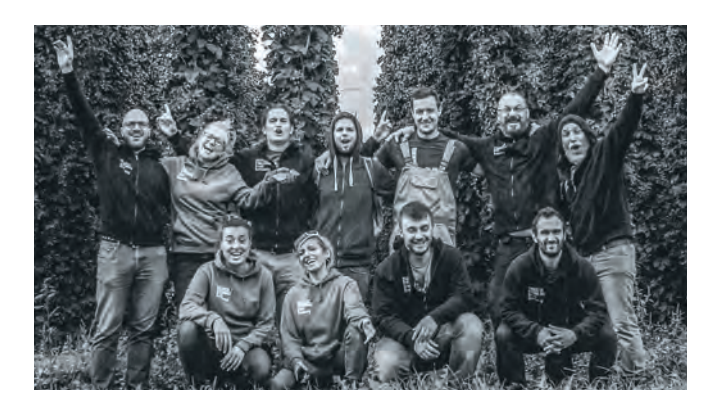
The team at the Croatian brewery Zmajska.

PET bottles are less good in terms of beer quality, the environment and consumer behaviour. Beer cans, although good container, still have best before even if empty and customer perception is not the same as of glass.